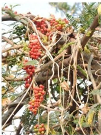
Tinospora cordifolia (Willd.) Miers