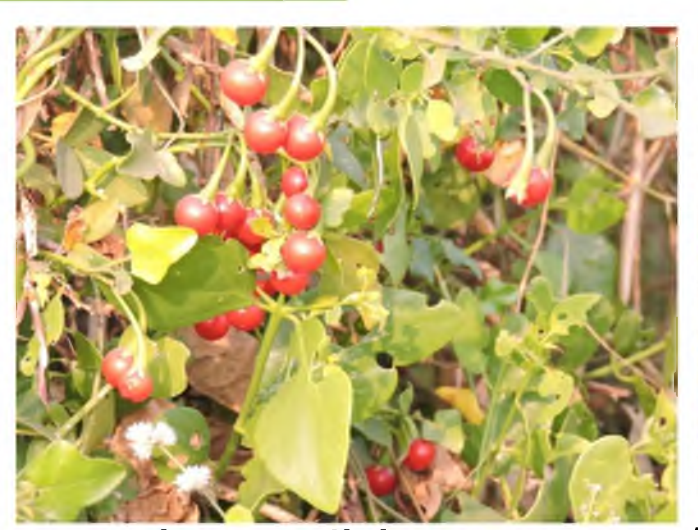
Solanum trilobatum L.