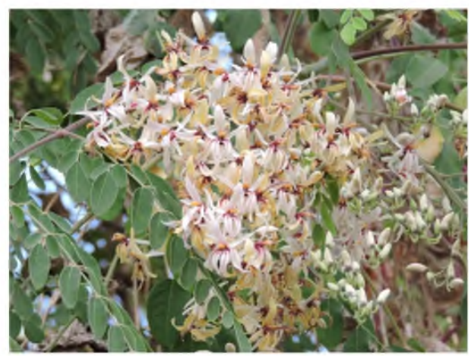
Moringa concanensis Nimmo